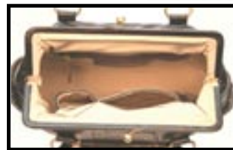
Inside view of the Bronze

F ashion forward, stunning and just plain fabulous! This fantastic creation is how the right balance of current trends, luxurious form and attention to feminine details means a handbag you will just love and love to show off. Crafted with softest yet durable Italian leather richly finished in three amazing colors to suit your finest taste and sense of style. Lined with a beautiful beige cotton. She stands 10 1/2 " tall x 13" across x 5" in depth.