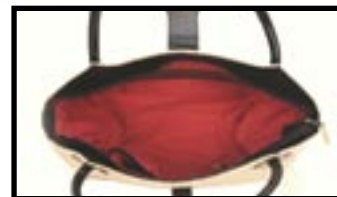
Inside view of all colors

She's back... Bigger and better than ever! The combination of shapes and texture gives this unique creation a modern fashion forward style while still remaining classically elegant and chic. This structured design is adorned with a soft pebble grain woven fabric, trimmed with a smooth, polished rich genuine Italian leather and accented with brushed antique gold hardware. Lined with a quality red wine colored cotton. She stands 7" tall x 15 1/2" across and 5 1/2" in depth.